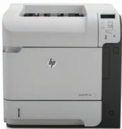
HP LaserJet Enterprise 600 M601dn